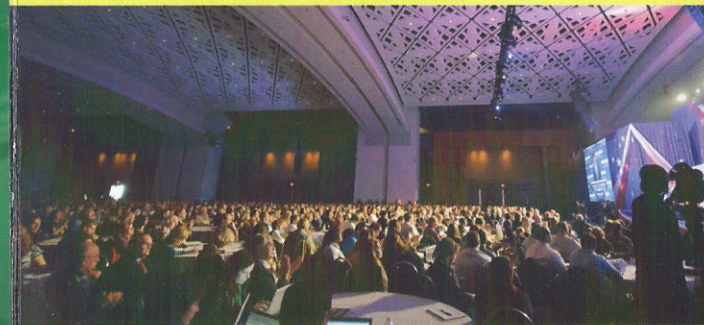
More than 2,000 AFP Foundation members listen to Gov. Mitt Romney at the Defending the American Dream Summit

Across the nation, AFP activists are fighting back against restrictive legislation, higher taxes, and a loss of economic freedom at all levels of government. Using AFP's Prosperity Alert system, activists get realtime updates about pressing issues or pending votes in Congress and learn how they can take action to make a real difference for our shared ideals.