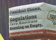
AFP Foundation Michigan members attend one of more than 40 stops of our nationwide Running on Empty Tour

In 2011, AFP Foundation held two of the most talked-about and highly-attended national conferences of the year. RightOnline , a gathering of the nation's best conservative bloggers and online activists, and our Defending the American Dream Summit , where thousands of members gathered for grassroots training and networking.