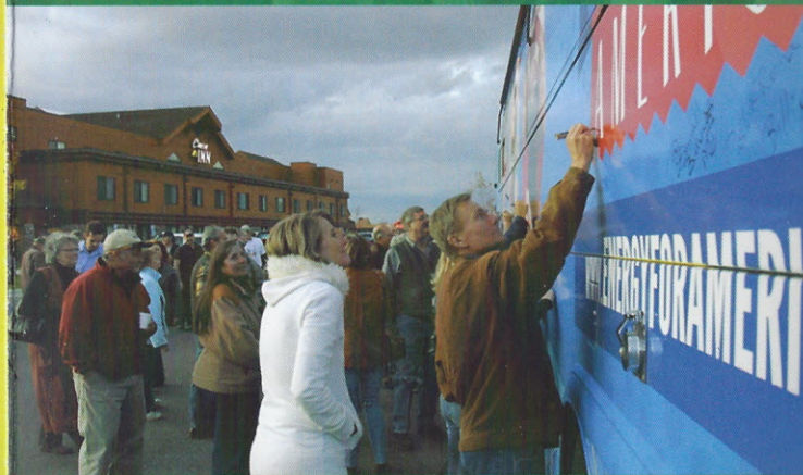
AFP activists sign the bus for our Energy for America Tour on its stop in Bozeman, MT

In addition to our aggressive stance on national issues, AFP frequently focuses on critical issues at the state and local levels. That's why we mobilized massive resources to combat New Jersey's Regional Greenhouse Gas Initiative (RGGI), where we conducted nearly 50 special events and training seminars, resulting in Governor Christie removing New Jersey from the Cap-and-Trade scheme.